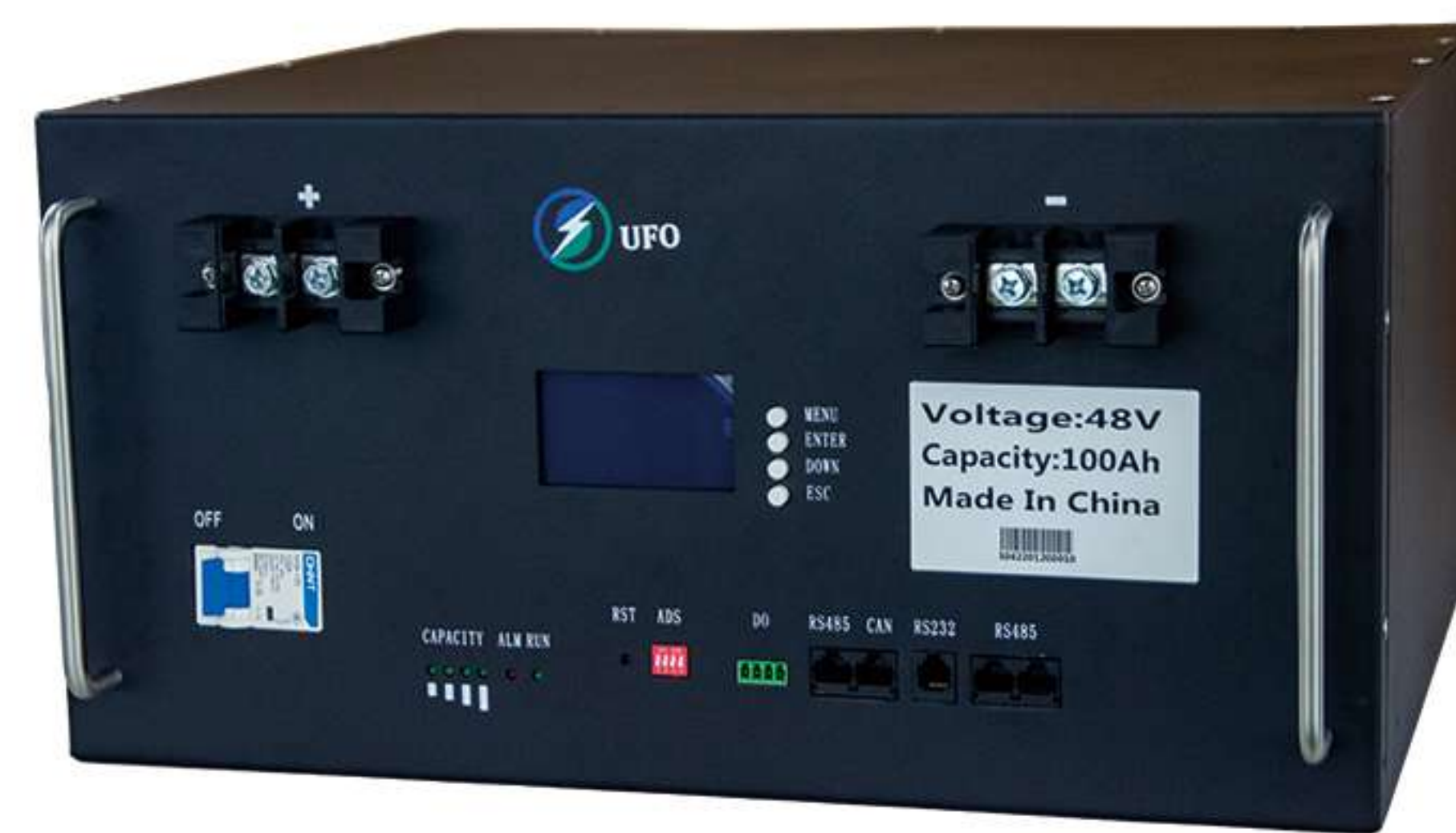
UFO LifePO4 BATTERY SPECIFICATIONS